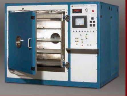
Above: Model PC 48 with optional heated shelves and standard PLC controller