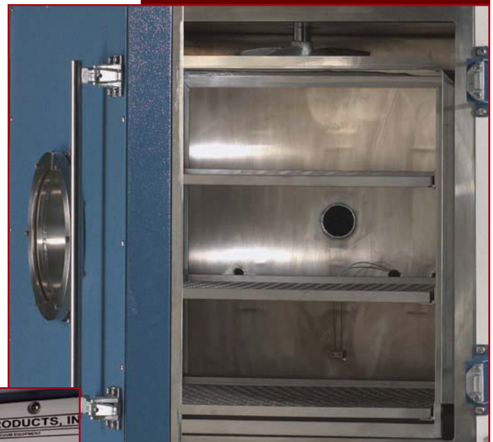
The photo detail above shows the all stainless steel chamber interior with inert gas stirring fan and removable sliding shelf configuration.